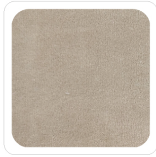
Sabbia - 520