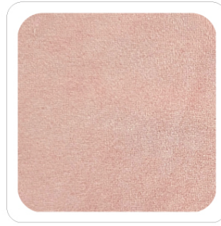
Rosa Cipria - 120