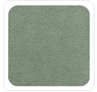
Menta - 222