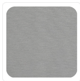
Grigio Chiaro - 90