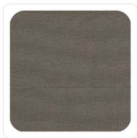
Tortora - 358