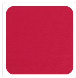
Rosso - 160