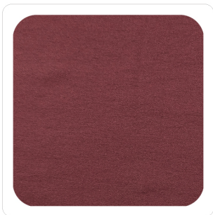
Bordeaux - 28