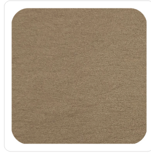
Beige - 35