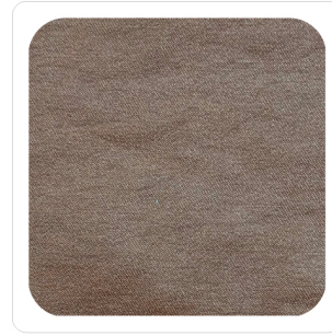
Biscotto - 5