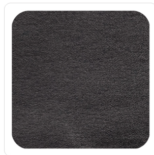
Nero - 31